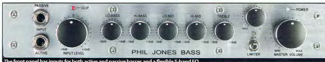
The front panel has inputs for both active and passive basses and a flexible 5-band EQ