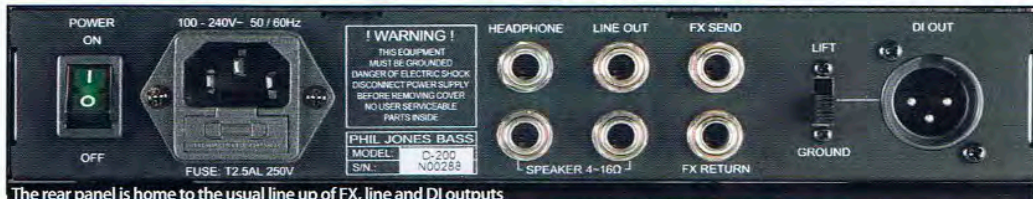
The rear panel is home to the usual line up of FX, line and DI outputs